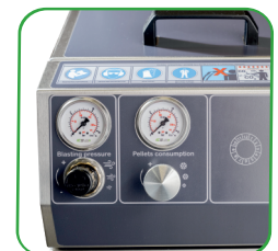
PRESSURE CONTROL, DRY ICE CONSUMPTION CONTROL