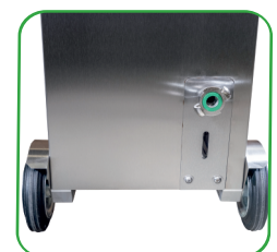
FILTERED WATER SEPARATOR