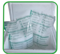
Packet of dry ice pellets